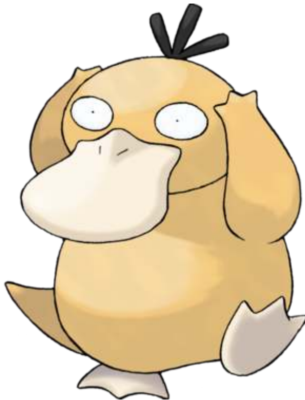
Figure 54: Psyduck (Pokémon number 54).