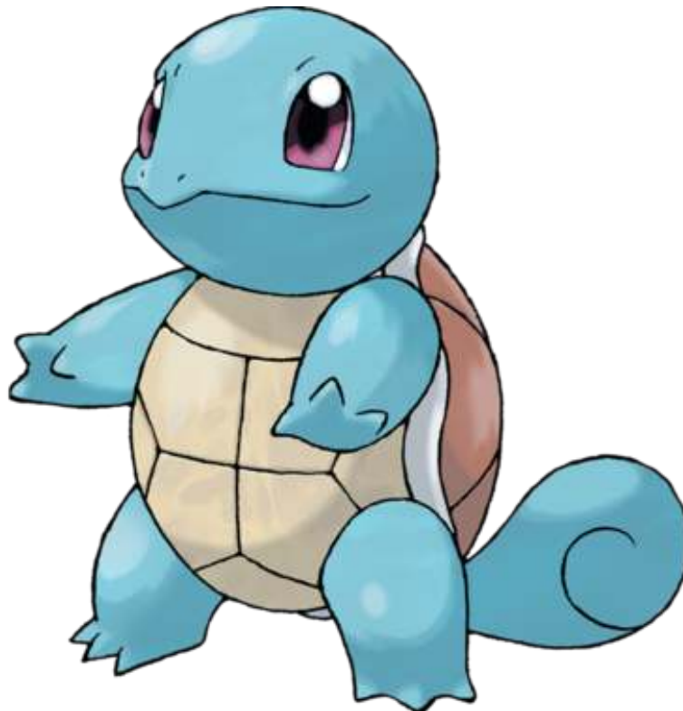
Figure 7: Squirtle (Pokémon number 7).