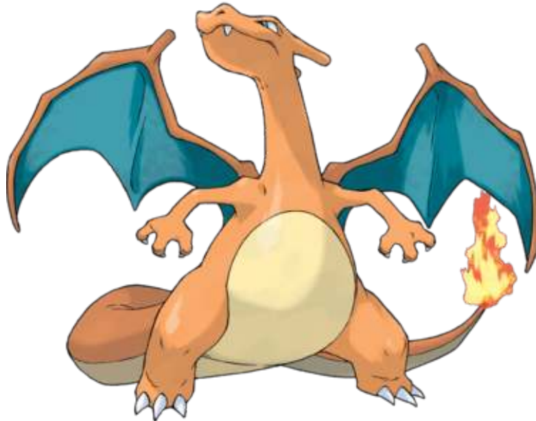
Figure 6: Charizard (Pokémon number 6).