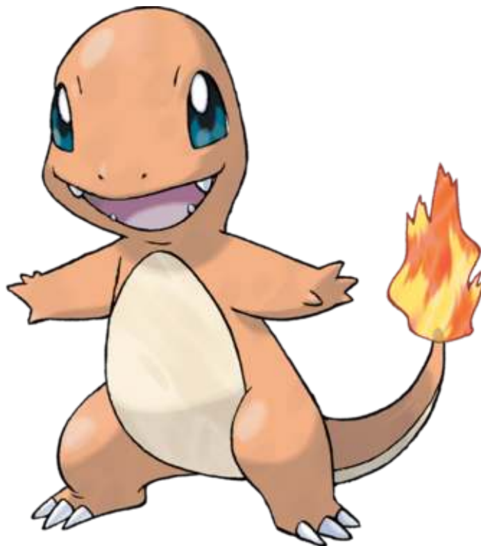
Figure 4: Charmander (Pokémon number 4).