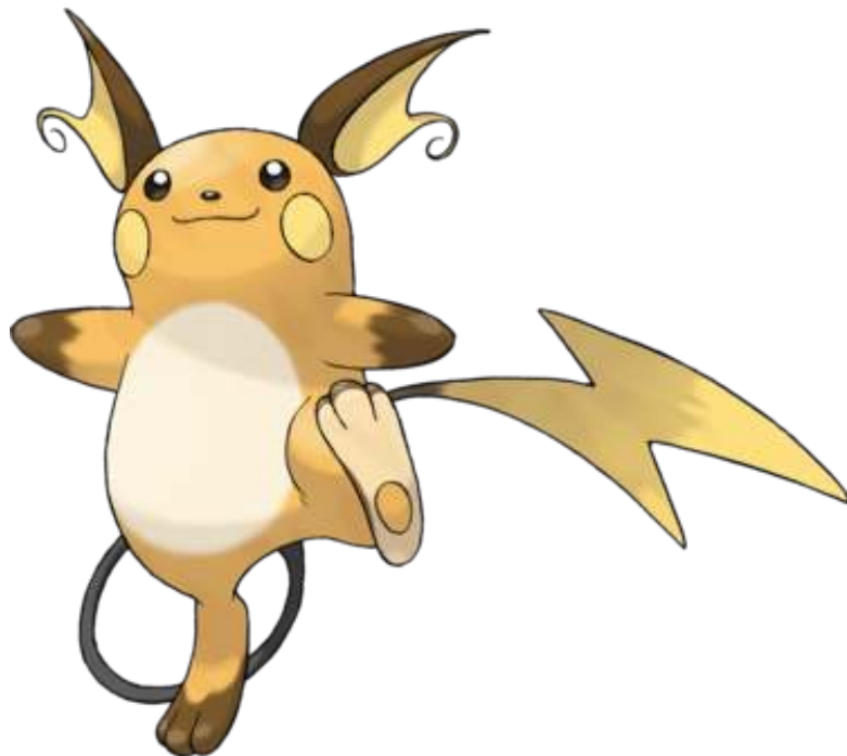
Figure 26: Raichu (Pokémon number 26).