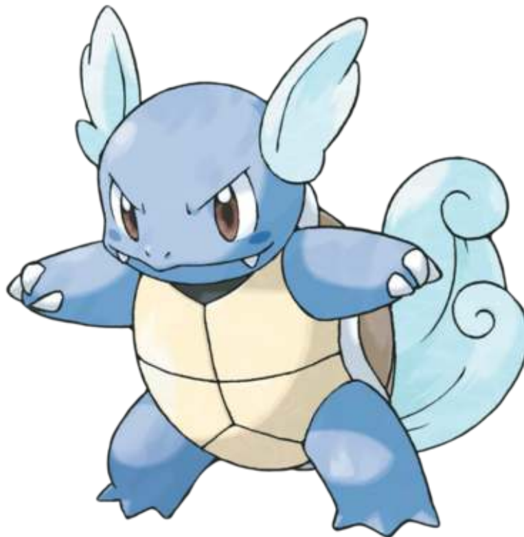
Figure 8: Wartortle (Pokémon number 8).