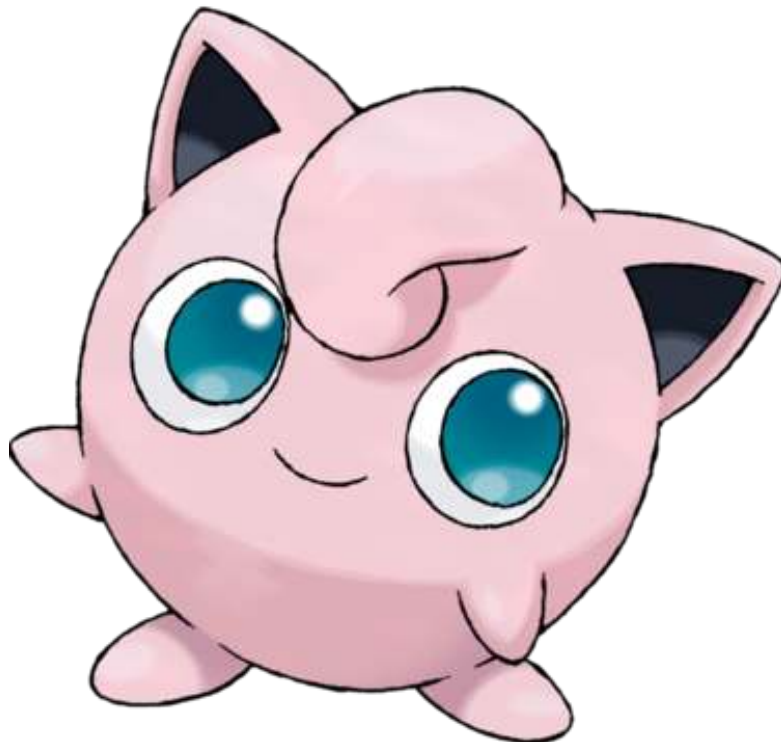
Figure 39: Jigglypuff (Pokémon number 39).