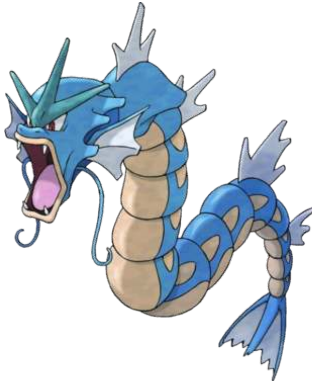
Figure 130: Gyarados (Pokémon number 130).