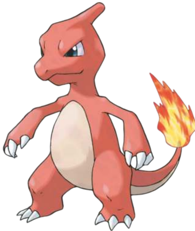
Figure 5: Charmeleon (Pokémon number 5).