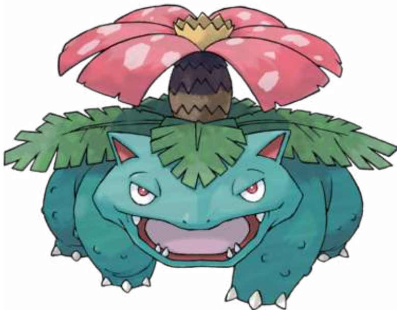
Figure 3: Venusaur (Pokémon number 3).