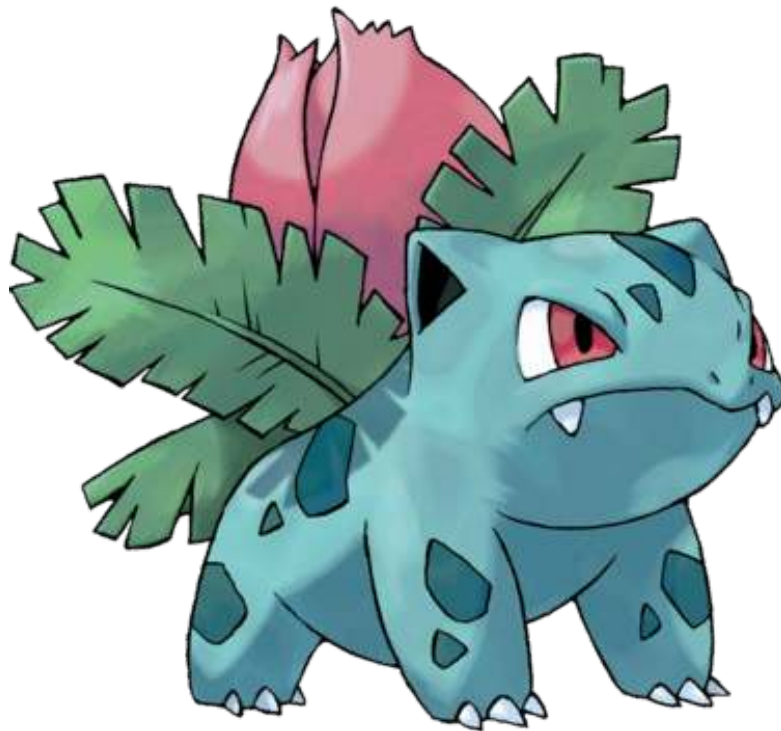
Figure 2: Ivysaur (Pokémon number 2).