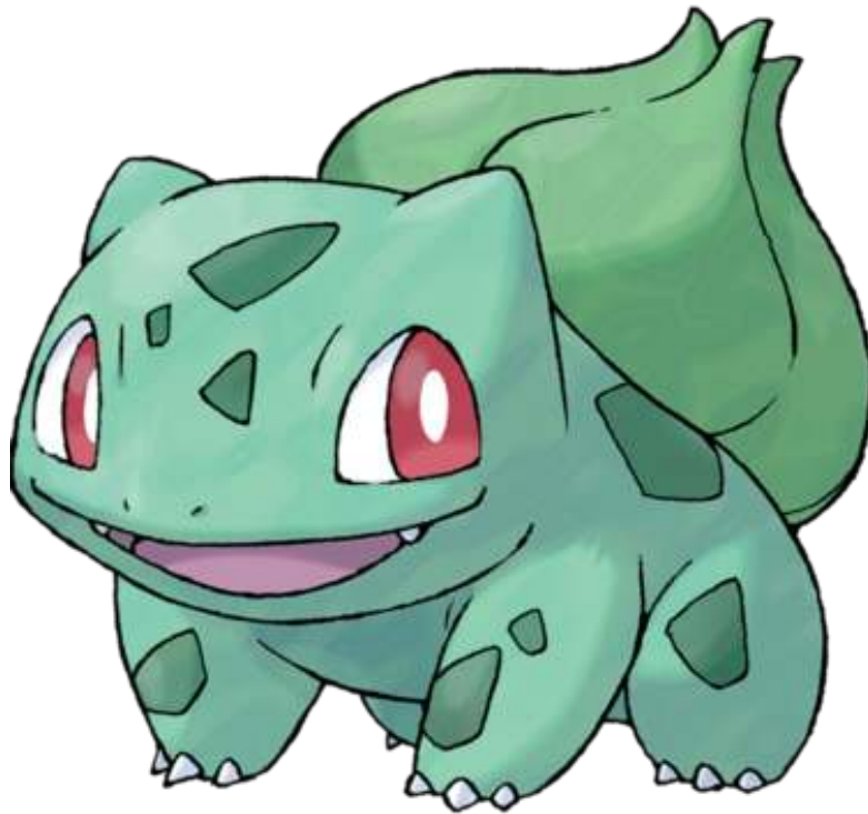
Figure 1: Bulbasaur (Pokémon number 1).