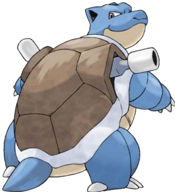
Figure 9: Blastoise (Pokémon number 9).