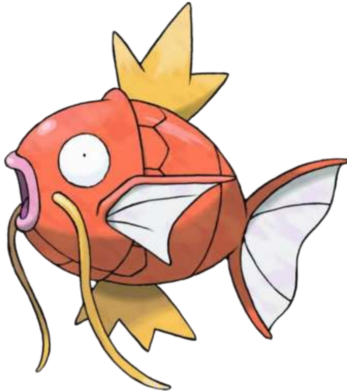
Figure 129: Magikarp (Pokémon number 129).